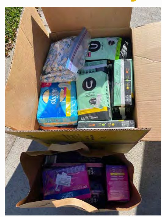
Go with the Flow fundraiser (Personal hygiene) We had hundreds of feminine hygiene products donated to Watertown area schools and the Waconia Gather & Grow food shelf.

Last week at our monthly meeting, we were able to present a check to the Waconia American Legion Auxiliary to go towards their Waconia Cares Project. They ship over 300 care packages to our deployed military during the holiday season.