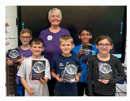
Watertown Lions distributed dictionary's at Watertown-Mayer Elementary, Christ Community Lutheran School & Zion Elementary in Mayer.